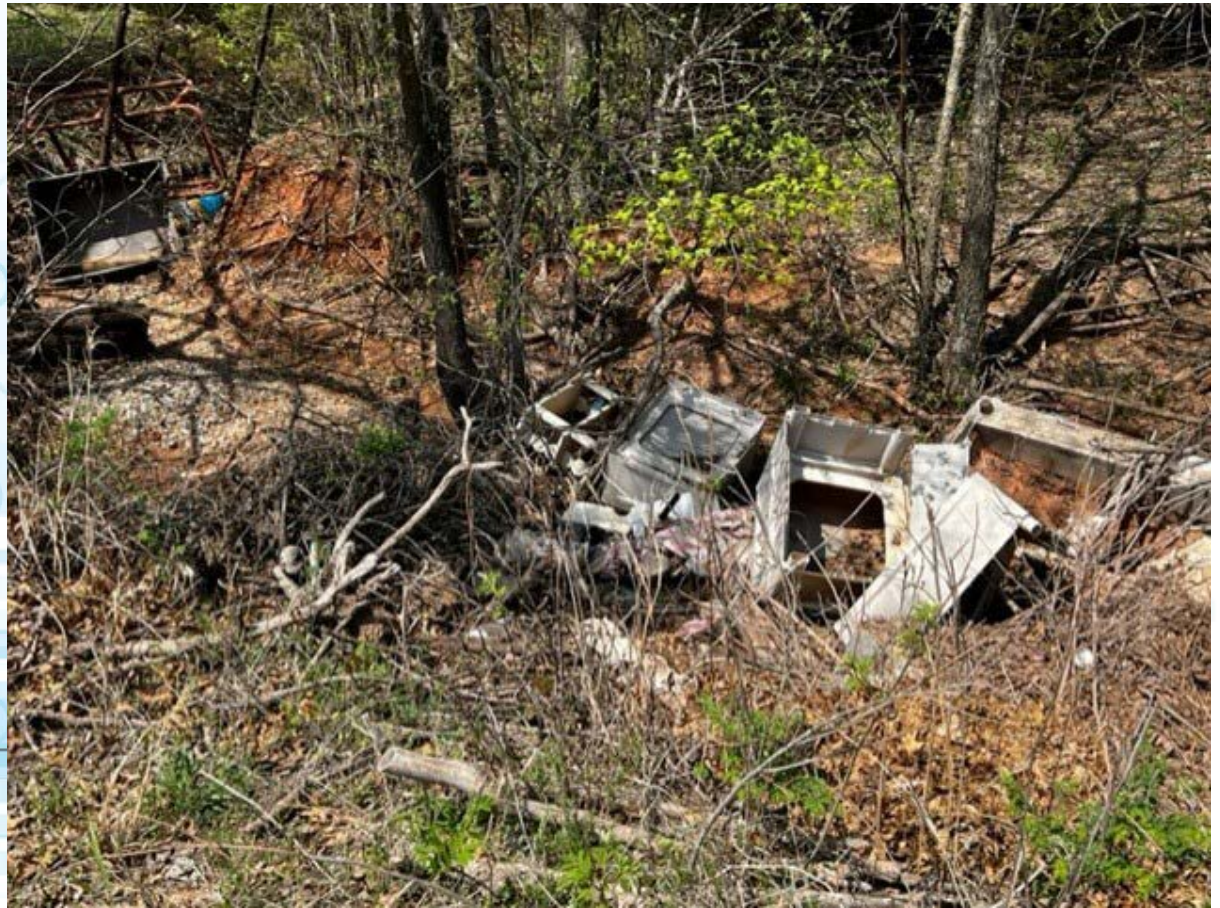
Image 1. An illegal roadside dump in rural Oklahoma containing old electronics. Cleanup was funded by DEQ's Solid Waste Management Grant Program.

As consumers continue to express significant interest in drop-off, rather than mail-back programs, DEQ will continue to supplement OCERA by assisting communities in hosting collection events for electronic waste.