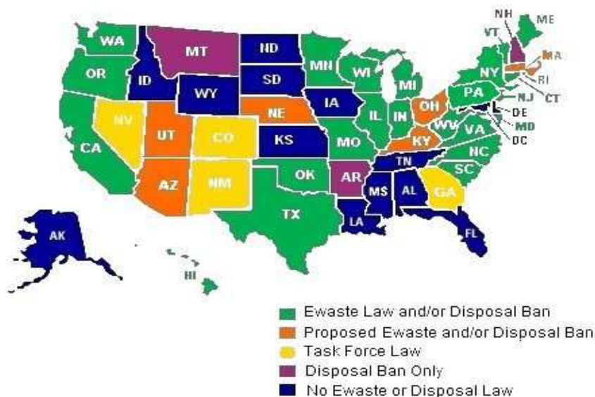
Figure 3: State Electronics Law Comparison

Whether new laws are passed, or current laws are amended, it is evident that national electronics laws are having an effect in the United States and consumers take advantage of the proper disposal options.