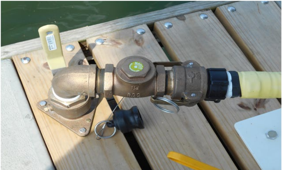
2a) Check valve on the pump out hose