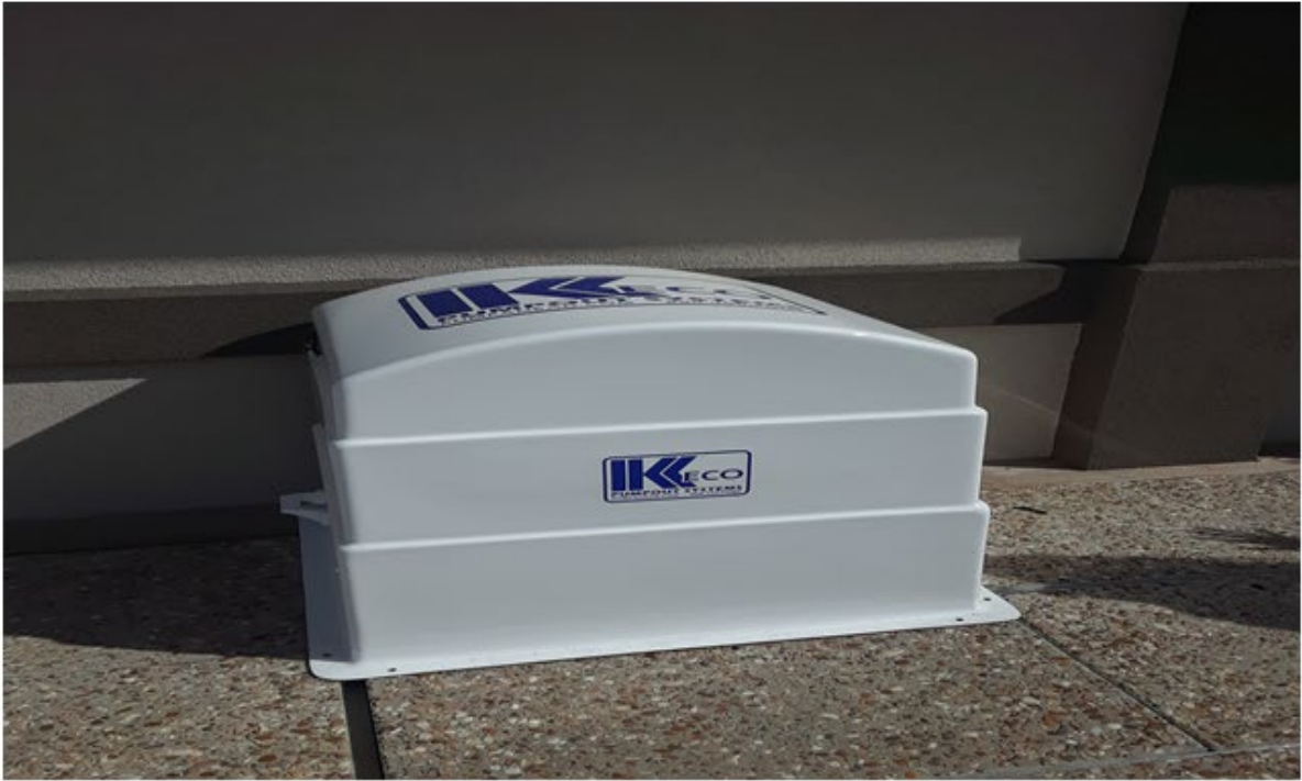
3b) Pump-out station cover

Bridgeview Marina & Resort on Lake Texoma, September 9, 2017