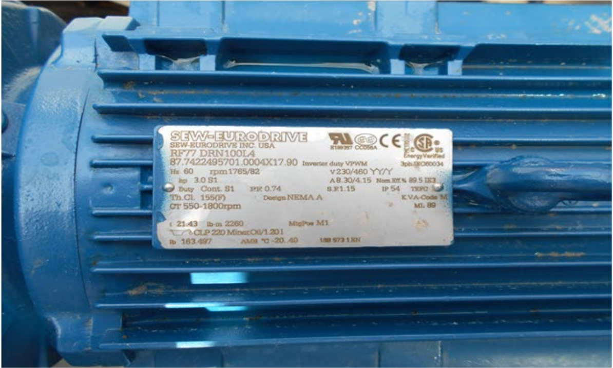
3a) Pump motor