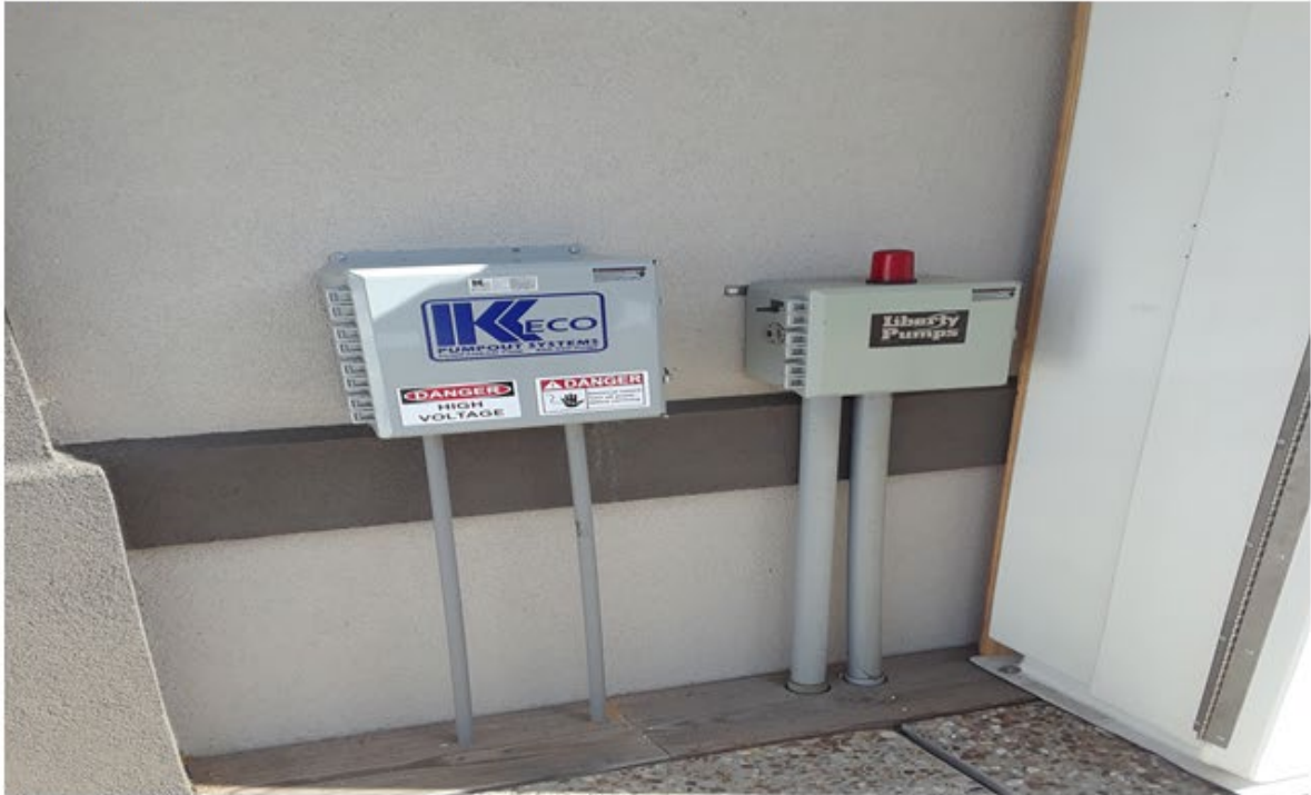
2b) Pump-out station electrical components