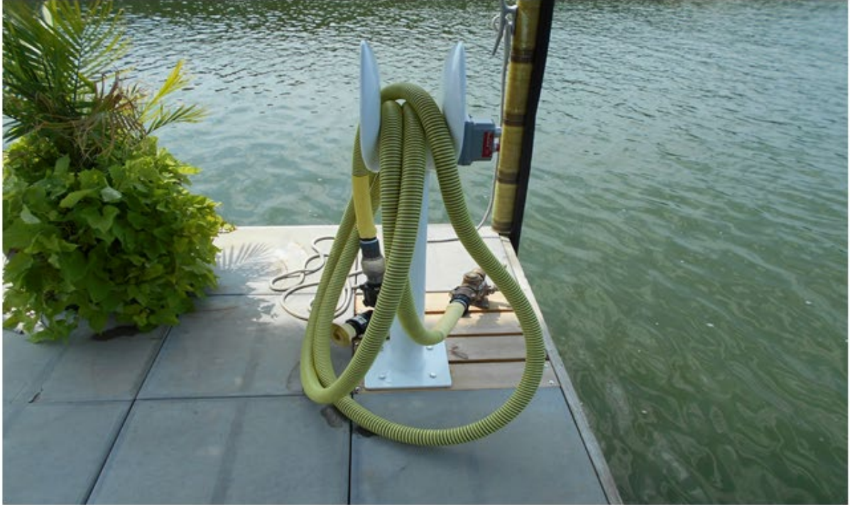
1a) Pump out hose on the end of the dock