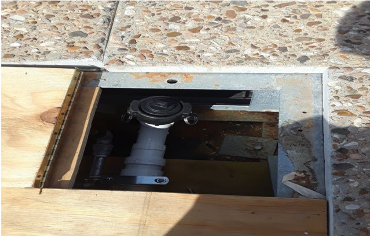
1b) Pump-out station