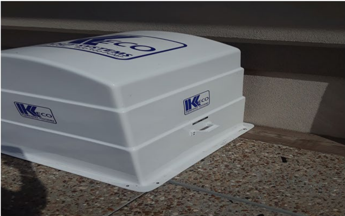
4b) Pump-out station cover