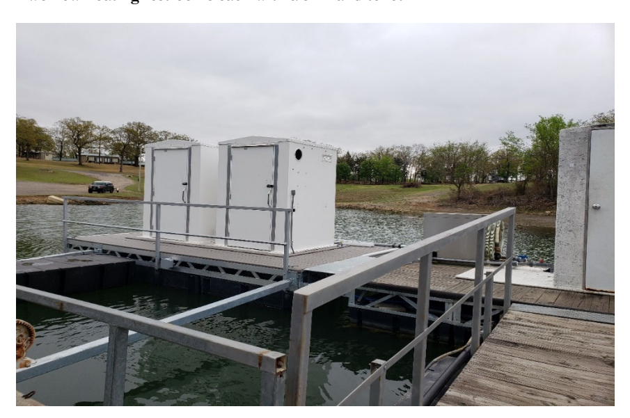
Photo Series #1. B&B's Cookson Bend Resort & Marina. April 10, 2021 Two new floating restrooms each with a sink and toilet

Mr. LaBrue also mentioned that he would like to build or buy a pump-out boat to provide septic service to boaters in the area, and may apply for another CVA grant to help with the funds for a pump-out boat.